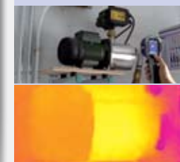
Inspection of this water pump shows no problem. The infrared image verifies that there is water in the pump cylinder and there is no danger of overheating the pump.