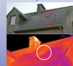
The infrared inspection locates missing insulation in the roof. This can now be repaired and further energy loss prevented.